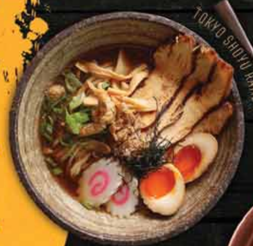
TOKYO SHOYU RAMEN

CHINESE DAN DAN NOODLES 56 White Noodles, Szechuan Chilli Oil Sauce, Shimeji Mushroom And Kangkong