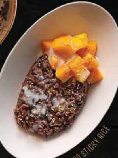
THAI MANGO STICKY RICE