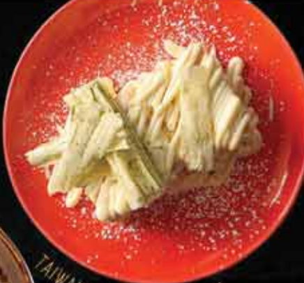
TAIWANESE CASTELLA CAKE