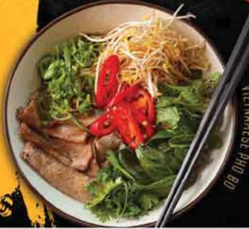
VIETNAMESE PHO BO