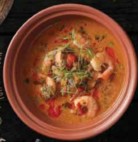
TOM YUM GOON